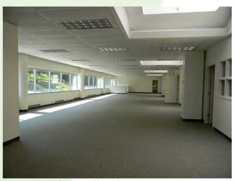
Open office floor plans with private offices & skylights