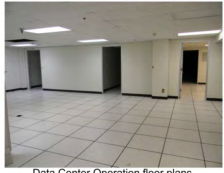
Data Center Operation floor plans with raised flooring chases