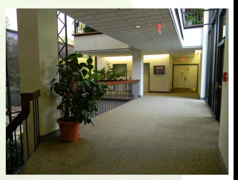
Modern, spacious & attractive common areas